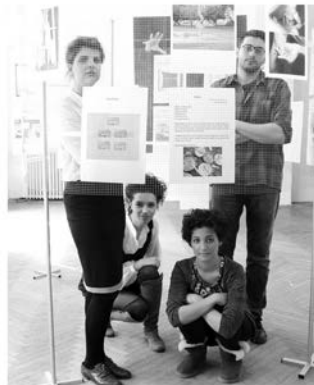
ABOUT AND AROUND CURATING: 7 x 3

The spiral form in the function of presentation of the work "Month of work" provides unobstructed insight into the work of artists and their processes of thinking in the observed time interval. It also shows the connection between the outer and inner world of authors and change of that relation over time. The way in which is necessary to show an interest in order to find out what is behind the artists' presentation of themselves, it is also necessary to find a way to get to the inner world. By touring finished works, we are entering even more into the intimacy of their creators and slowly realizing the course of thoughts and course of formation of the work concept.