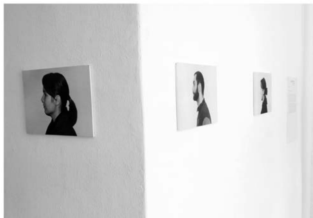
ABOUT AND AROUND CURATING: 7 x 3