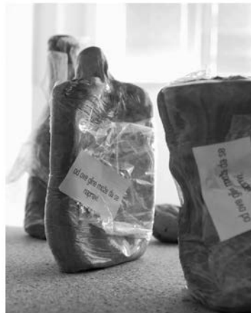
ABOUT AND AROUND CURATING: 7 x 3