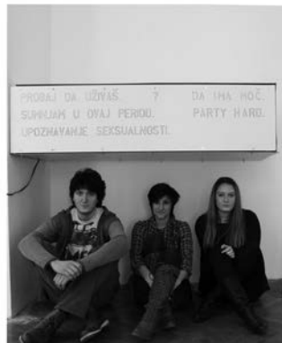
ABOUT AND AROUND CURATING: 7 x 3

The day of birth becomes completely impersonal, and instead of celebration it deforms into the test of fitting into the required behavior and goals. The results of the survey on the social expectations from an individual based on the age category, to which he/she belongs, are written on the box aiming each visitor toward the video work. The box separates visitor from the real space, bringing him to a direct contact with the work. This work has a different, individual meaning for everyone. That meaning is in the proportion with the empathy to which contributes the isolation and specific expectations written on the box.